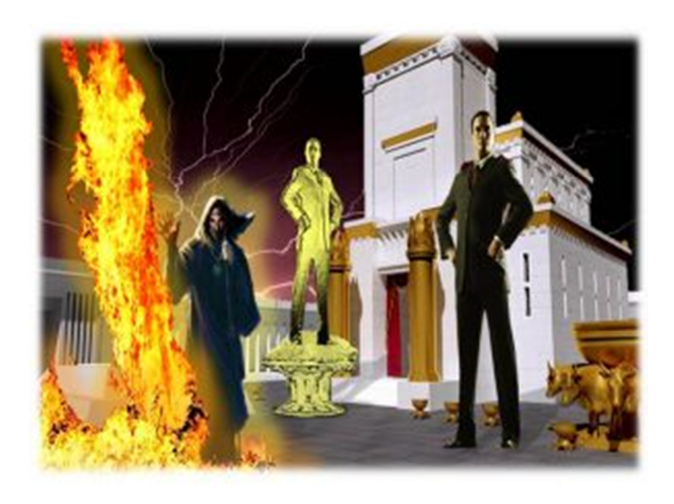
Dan 12:11-12 And from the time that the daily sacrifice shall be taken away, and the abomination that maketh desolate set up, there shall be a thousand two hundred and ninety days. 1 290 days Blessed is he that waiteth, and cometh to the thousand three hundred and five and thirty days. 1 335 Days